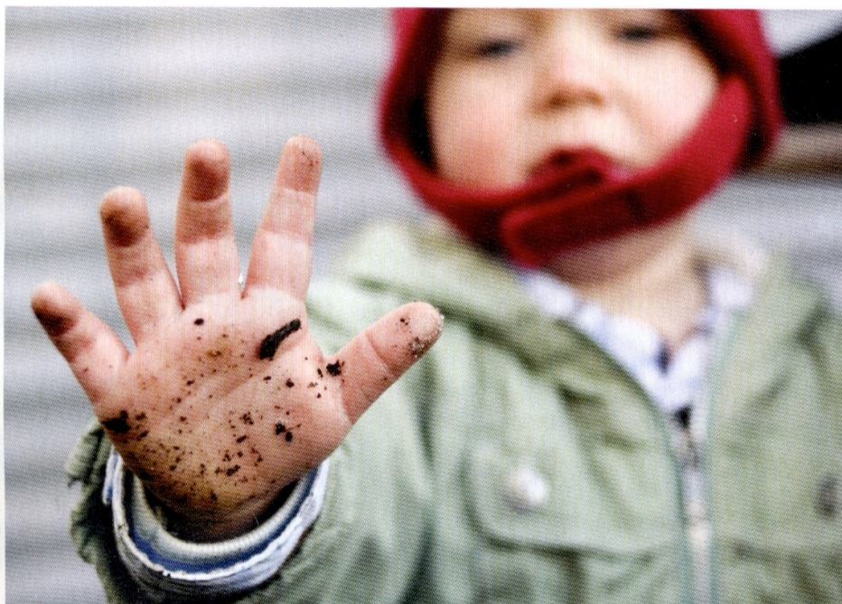
Attending daycare early in life or having older siblings protects kids against leukaemia